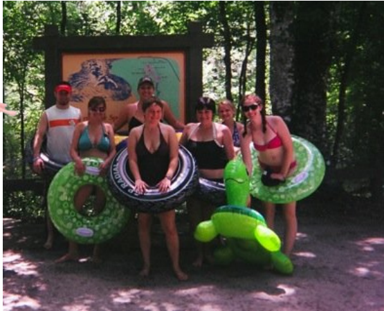
Yurtle the Turtle with the gang right before our plunge into cool waters